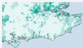
Indicators: maps, charts and datatables